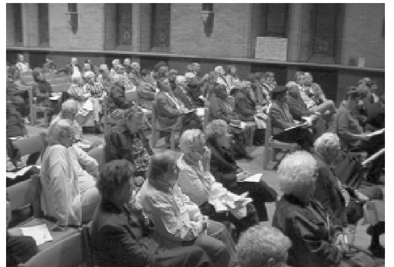
A portion of the Town Meeting audience of over 100 at the Chapel.